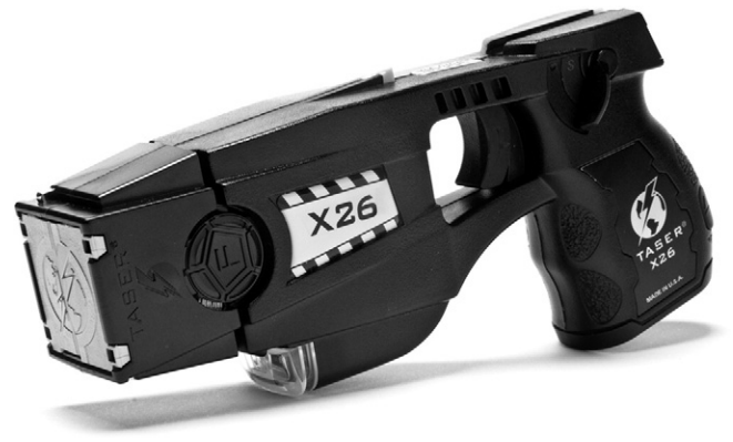
Figure 1. The Taser model X-26 conducted electrical weapon.

Controlled studies of the cardiac and physiologic effects and risks of conducted electrical weapons in animals and healthy human volunteers have begun to address the topic of conducted electrical weapon safety. However, these studies may not accurately reflect risks among criminal suspects in whom coexisting medical and psychiatric conditions, alcohol and drug use, and other factors are often present. These factors may increase risk in this population and make epidemiologic investigations during actual use critical to provide a realistic risk assessment of these weapons. We performed the first large multicenter study to determine the incidence of injuries and adverse outcomes after law enforcement use of conducted electrical weapons.